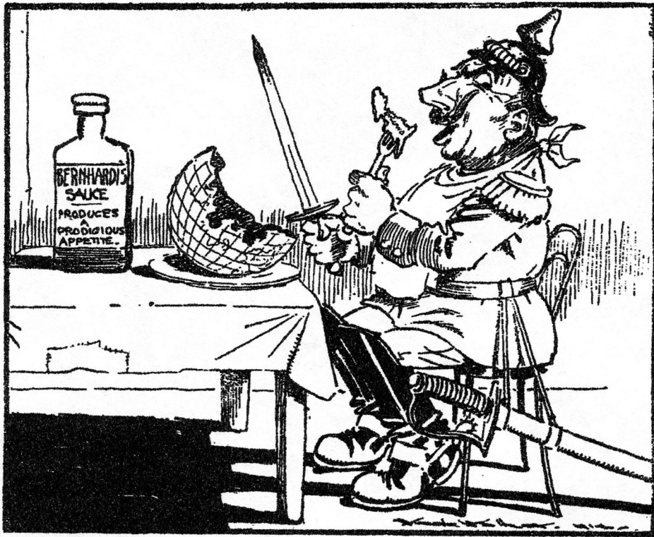
A cartoon published in Britain early in 1914. It is entitled 'The Kaiser's Dream: The End of the World'. Bernhardi was a German general who wrote a best-selling book entitled 'Germany and the Next War'.