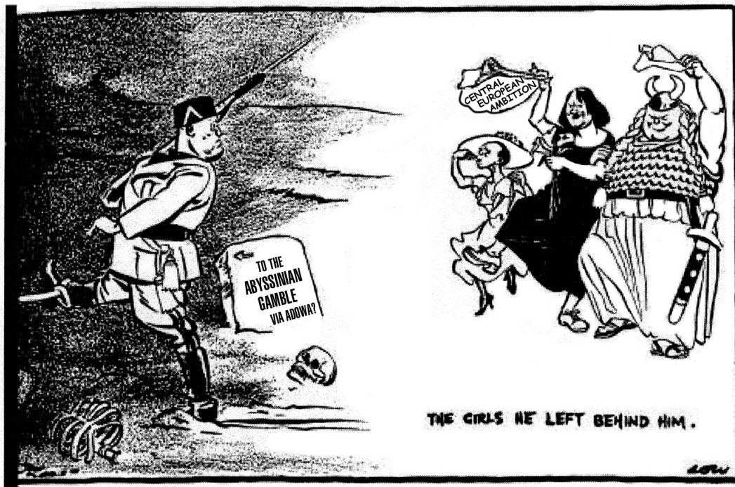
A British cartoon published in May 1935. The three figures on the right are Hitler and two of his leading ministers.