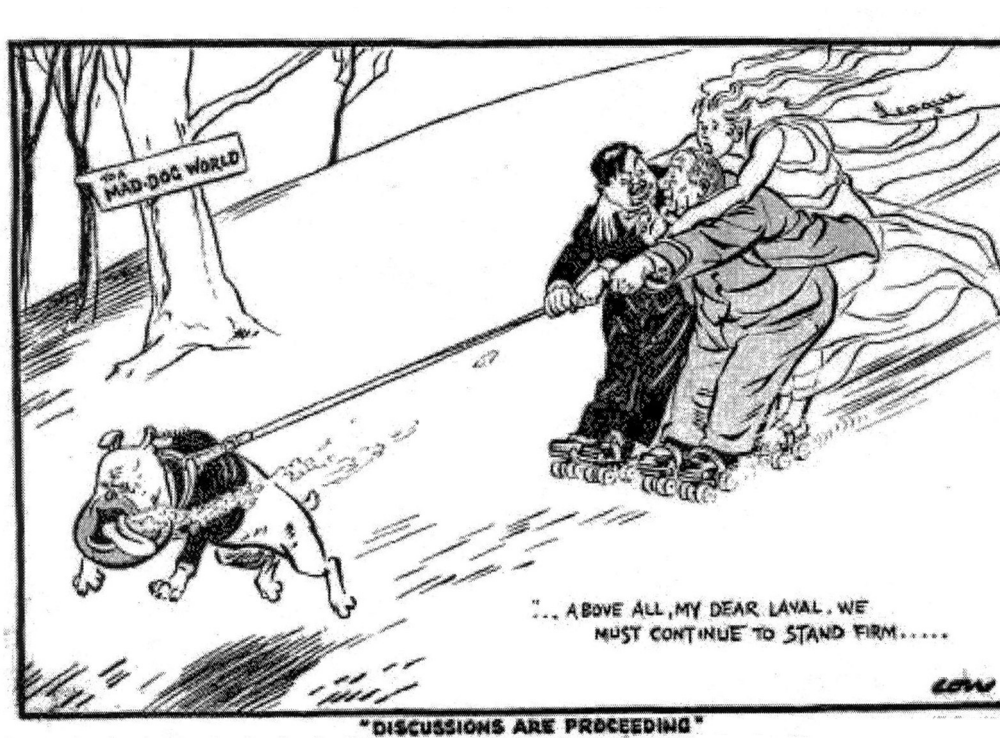
A British cartoon published in August 1935. The two men are Laval and Baldwin (Prime Minister of Britain).